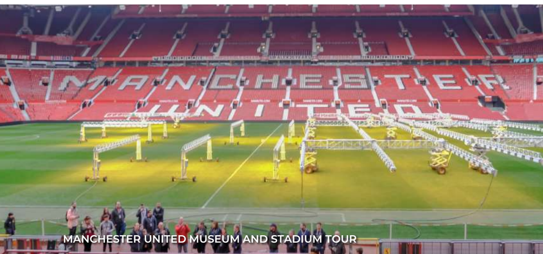
MANCHESTER UNITED MUSEUM AND STADIUM TOUR