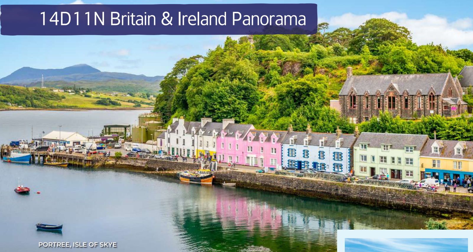
PORTREE, ISLE OF SKYE