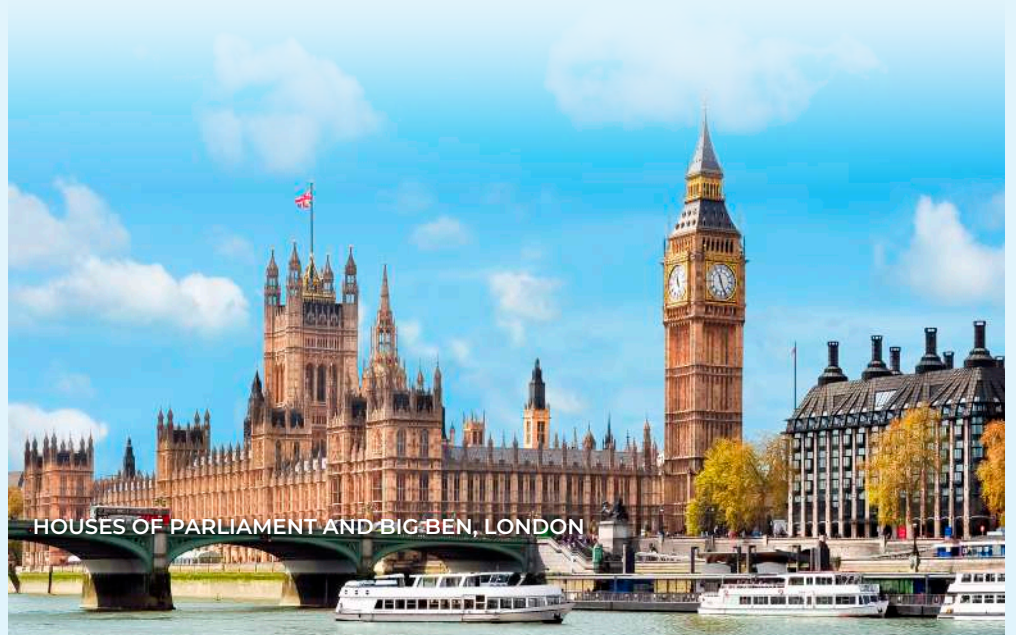
HOUSES OF PARLIAMENT AND BIG-BEN, LONDON

* Note: Hotels subject to final confirmation. Should there be changes, customers will be offered similar accommodations as stated in this list.